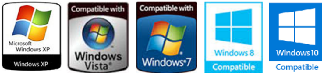
Figure 1. Supported Operating Systems

The PDF-XChange Drivers API SDK supports all Windows (32/64 bit) operating systems from Windows XP* and later: